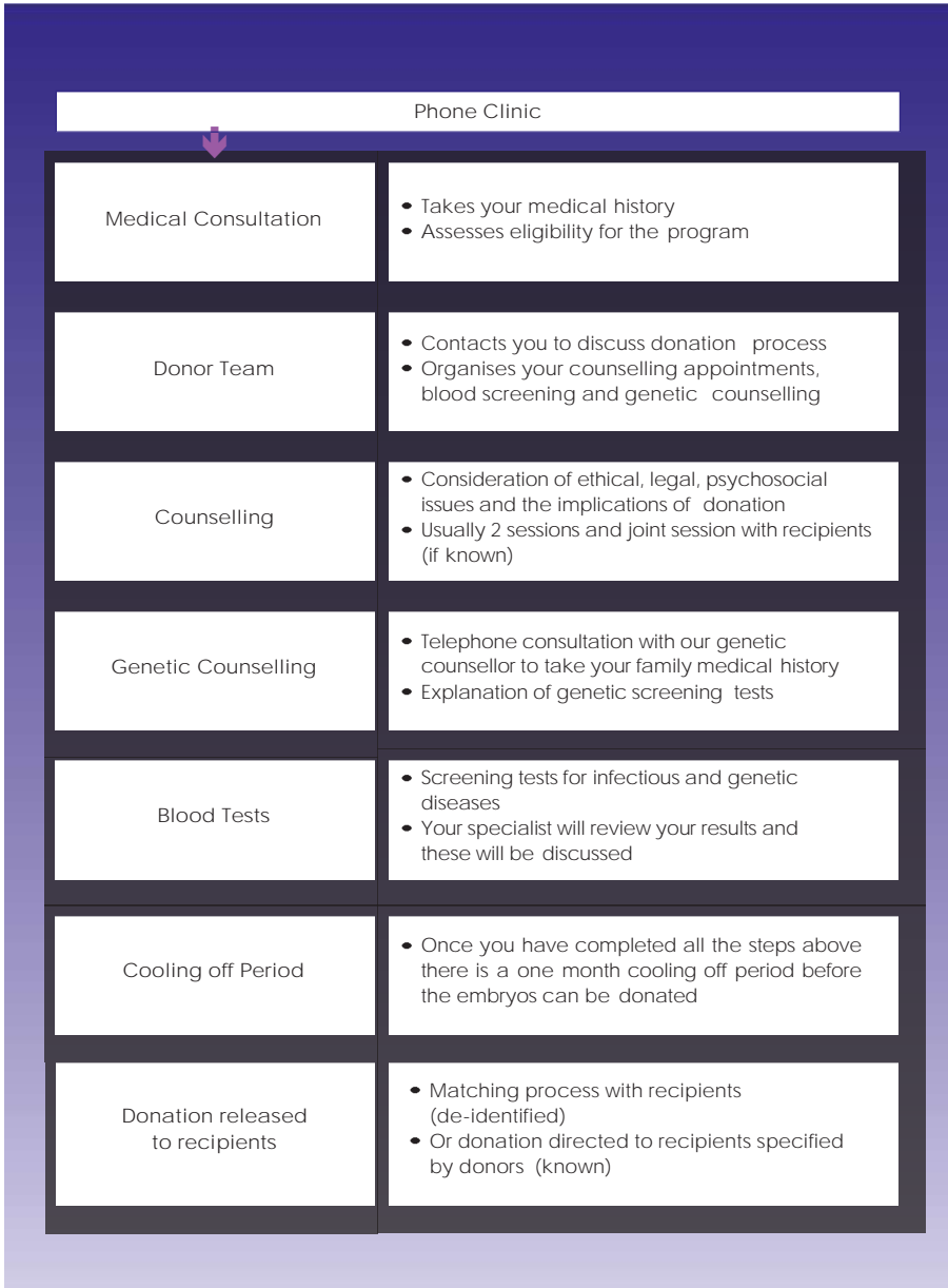
Figure 1 | Embryo donor preparation